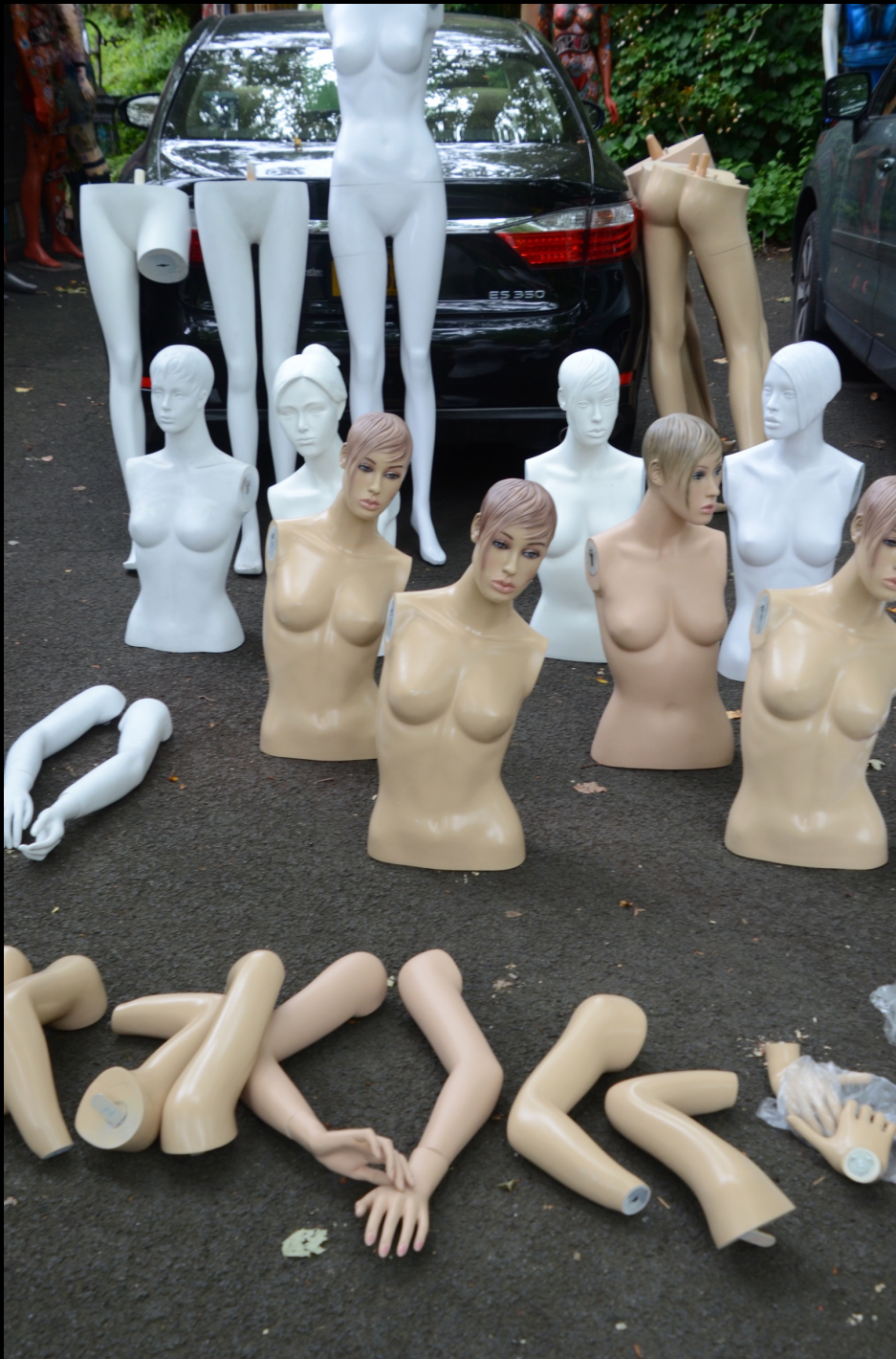
Waiting to be brought back to life