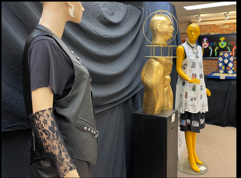
Art Reborn Mannequins